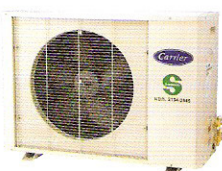
◀ 38RE-G2 Series

Carrier reserves the right to make changes in specifications without prior notice. บริษัทฯ ขอสงวนสิทธิ์ที่จะเปลี่ยนแปลงรายละเอียดข้างต้น โดยมีต้องแจ้งให้ทราบล่วงหน้า